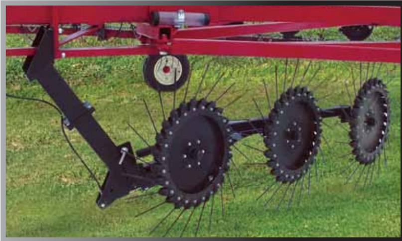
A 2 or 3 wheel center kicker assembly is optional for the Hi-Capacity rakes.