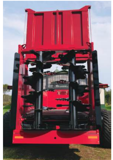
SIDE TRANSPORT LIGHTS

The dual apron gearboxes on each side of the PS6180 & PS6199 offer heavier outputs than the competition to provide strength and long life.