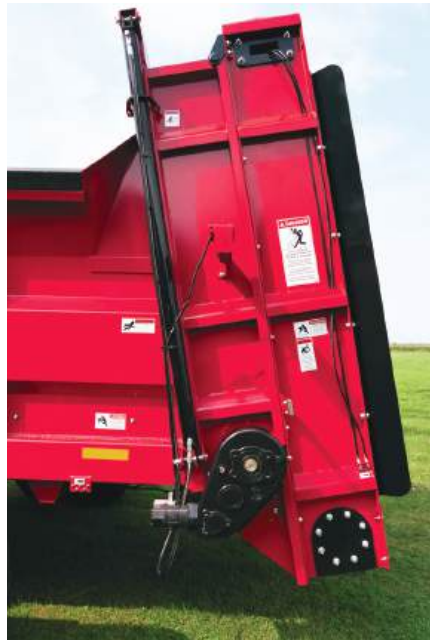
DUAL APRON GEARBOXES

The dual apron gearboxes on each side of the PS6180 & PS6199 offer heavier outputs than the competition to provide strength and long life.