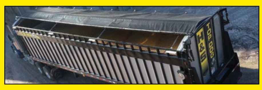
The BIG Dog & TOP DOG feature an electric actuator (D) and roof hood (E) as options.