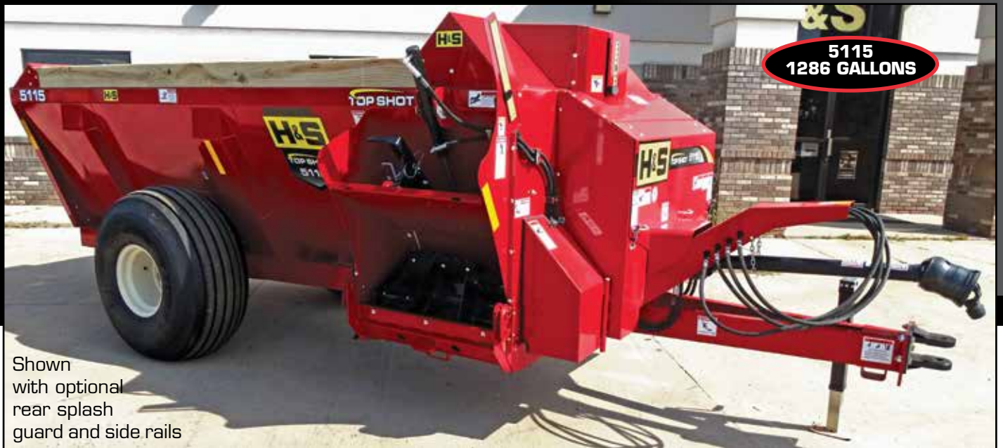
Shown with optional rear splash guard and side rails