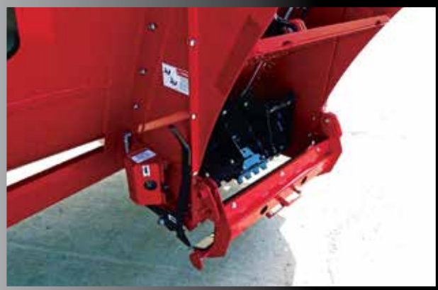
The 5115 features a 3 Section - 30" Expeller with a quick release poly-lined fine spread pan.