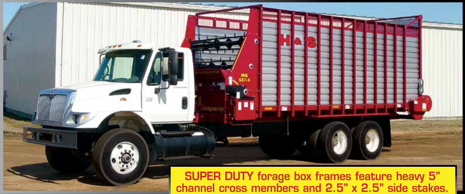
SUPER DUTY forage box frames feature heavy 5" channel cross members and 2.5" x 2.5" side stakes.