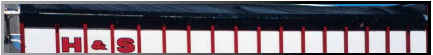
Shown with the optional heavy-duty side-to-side electric roll tarp.

The optional front-to-rear or side-to-side electric roll tarps are a nice feature to keep that valuable forage from blowing out during transport.